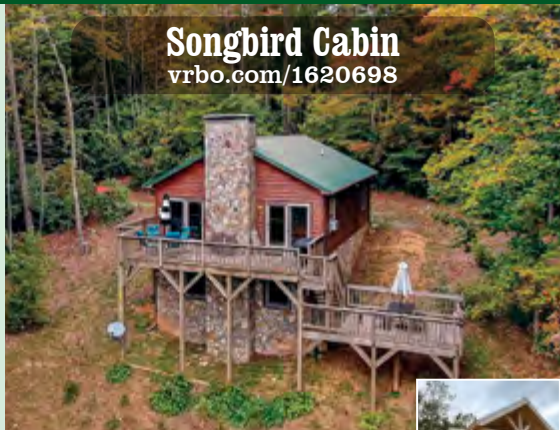
Songbird Cabin vrbo.com/1620698

Cornett Deal Christmas Tree Farm & Vacation Rentals Call: 828-964-6322