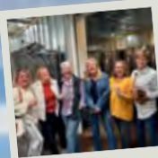
tours and tastings