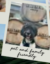
pet and family friendly