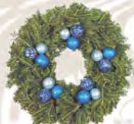
Blue Christmas Wreath

FRASER FIR CHRISTMAS TREES, WREATHS & GARLAND FROM THE MOUNTAINS OF NORTH CAROLINA AVAILABLE IN LARGE QUANTITIES