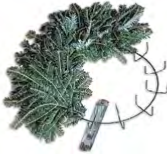
Clamp-Type Wreath Frames & Machines