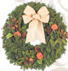
European Country Wreath