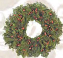
Santa Clara Wreath

OUR COMPANY KEEPS UP WITH THE LATEST RESEARCH AND DEVELOPMENTS, AND GOES TO THE HIGHEST MEASURES TO PROVIDE A HIGH QUALITY TREE TO YOU FRESH AND ON TIME, SO YOUR BUSINESS WILL BE A SUCCESS!