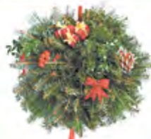
Three Mix Kissing Ball