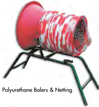
Polyurethane Balers & Netting