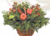
European Country Basket

PROUD TO BE THE THIRD GENERATION IN OUR FAMILY BUSINESS, WITH A COMBINED 80 YEARS OF EXPERIENCE GROWING HIGH QUALITY FRASER FIR CHRISTMAS TREES.