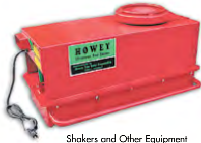
Shakers and Other Equipment