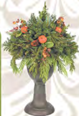
European Country Urn

OUR COMPANY KEEPS UP WITH THE LATEST RESEARCH AND DEVELOPMENTS, AND GOES TO THE HIGHEST MEASURES TO PROVIDE A HIGH QUALITY TREE TO YOU FRESH AND ON TIME, SO YOUR BUSINESS WILL BE A SUCCESS!