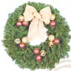
Coco Elegance Wreath

FRASER FIR CHRISTMAS TREES, WREATHS & GARLAND FROM THE MOUNTAINS OF NORTH CAROLINA AVAILABLE IN LARGE QUANTITIES