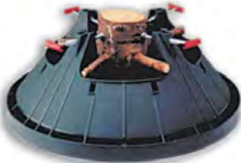
Cinco, Yule Tree, Gunnard & More